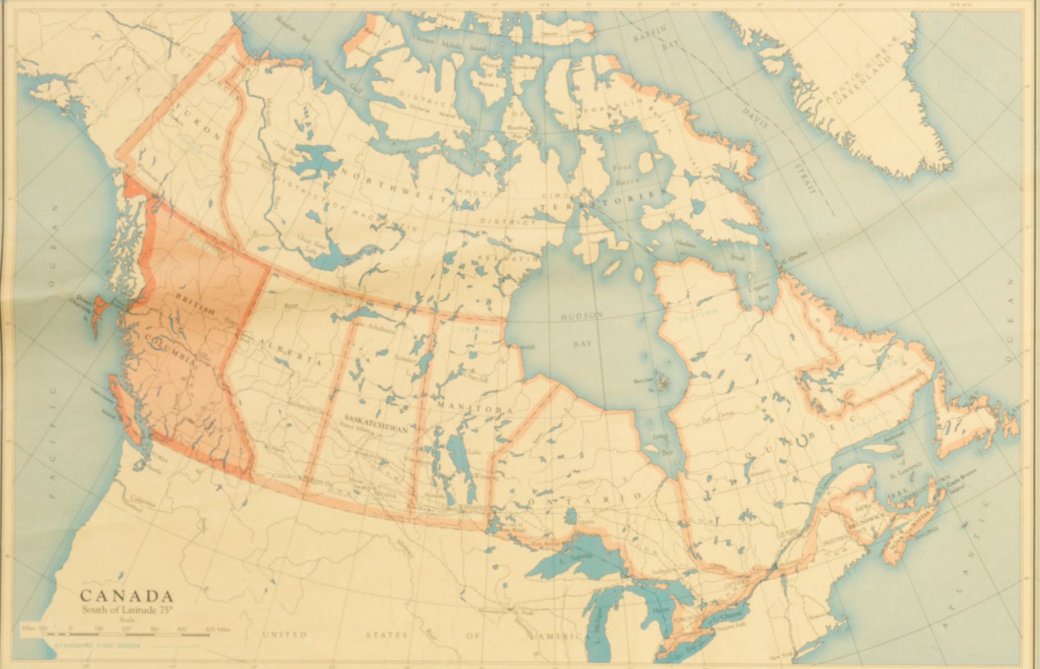
CANADA South of Latitude 75°